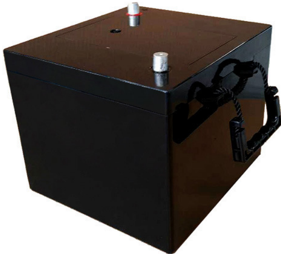
GS-12-130X Combat tank and Armoured Vehicle Battery