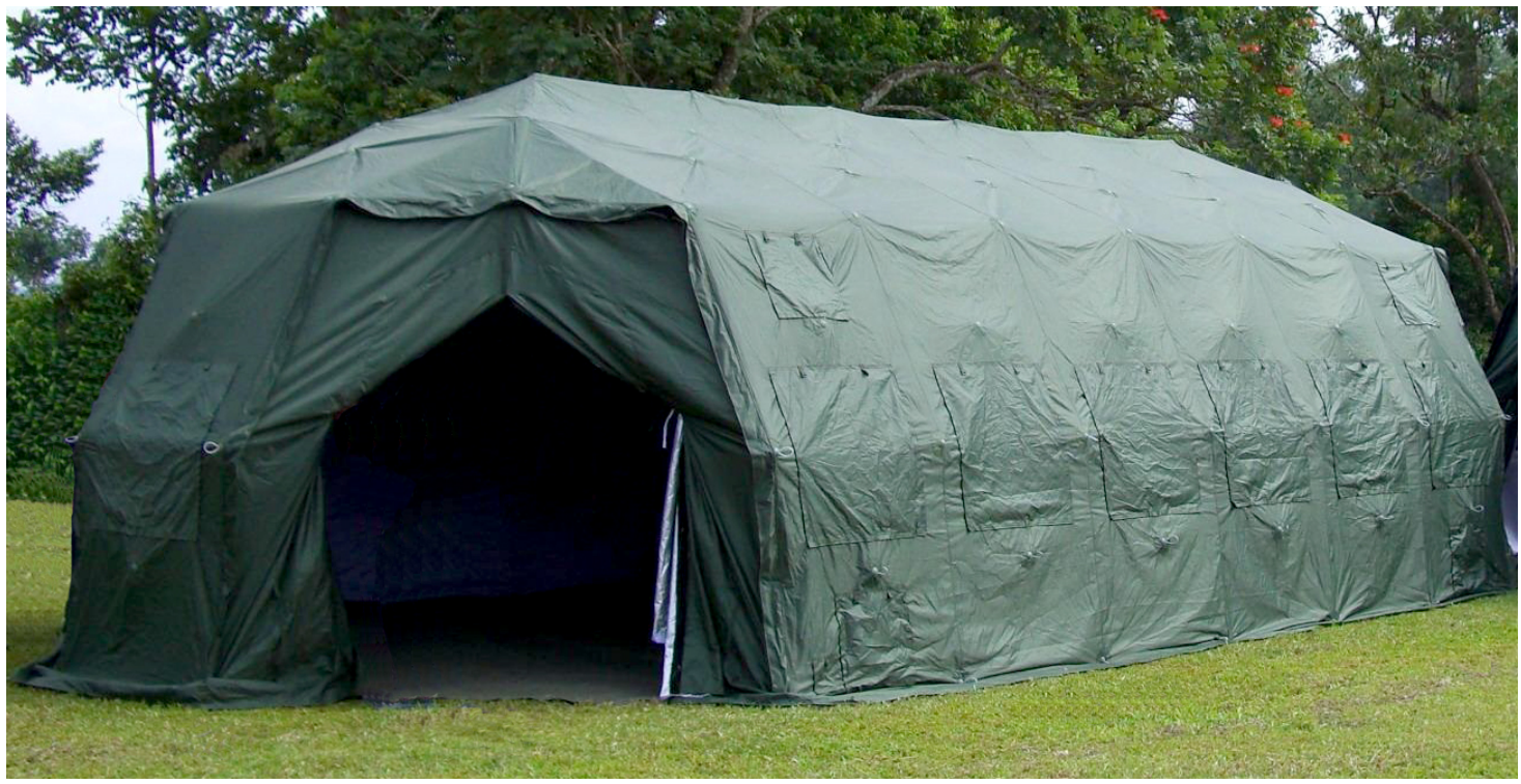
6A model. A series

www.goldenseason.com.sg | www.gseason.com